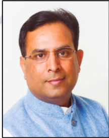
Capt. Abhimanyu Ex Cabinet Minister