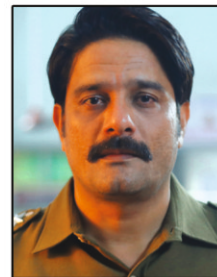
Jaideep Ahlawat Bollywood Actor