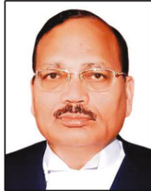
Justice Suryakant Hon'ble Justice Supreme Court